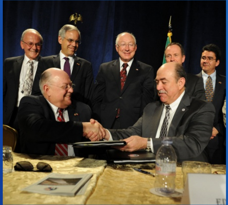
Signing of Minute 319 on November 20, 2012