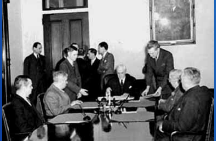
Signing of the Treaty for the Utilization of the Colorado River and Tijuana Rivers and the Rio Grande